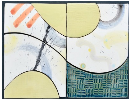
Caroline Egleston ORBIT, A Tile Scape, detail, ceramic, 40 x 30 cm

For high res images and further information please contact: Caroline Egleston caroline@piccolpasso.com tel: 0781 6435126