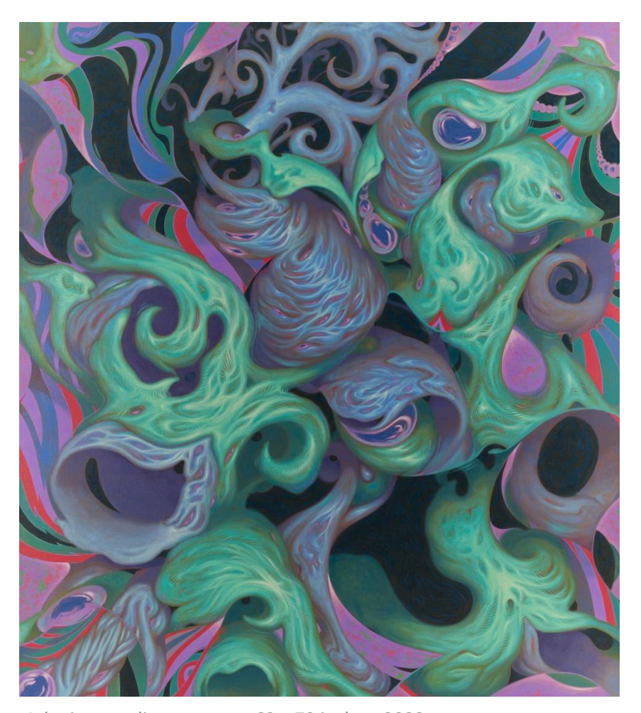
Julanite, acrylic on canvas, 63 x 70 inches. 2022.

67A York Street, Marylebone, London, W1H 1QB